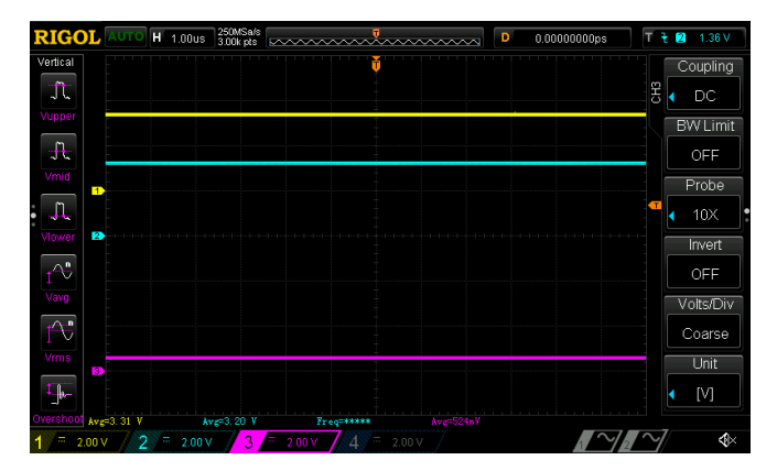
Figure 4. Device functionality then SPI code 255 at VDD 3.3V

Channel 1 (yellow/top line) – PIN#1 (VDD) Channel 2 (light blue/2nd line) – PIN#4 (LED1_1) Channel 3 (magenta /bottom line) – PIN#10 (FB1)