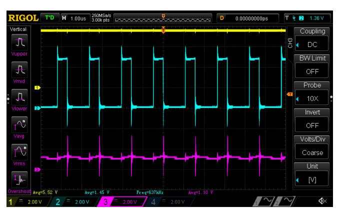
Figure 3. Device functionality then SPI code 255 at VDD 5.5V

Channel 1 (yellow/top line) – PIN#1 (VDD) Channel 2 (light blue/2nd line) – PIN#4 (LED1_1) Channel 3 (magenta /bottom line) – PIN#10 (FB1)