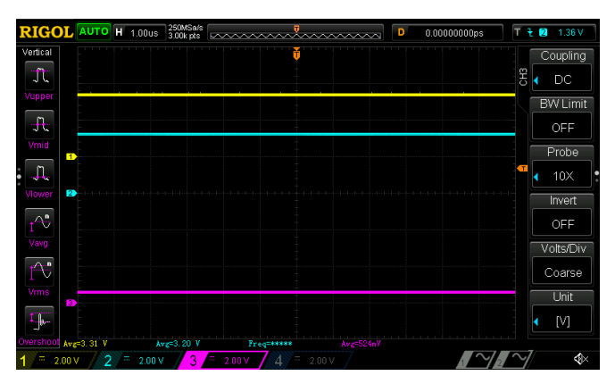
Figure 8. Device functionality then SPI code 128 at VDD 3.3V

A constant current LED driver with SPI control can be easily implemented using a Green PAK IC. It has low power consumption, small board area footprint, and only a few external components needed to complete the design.