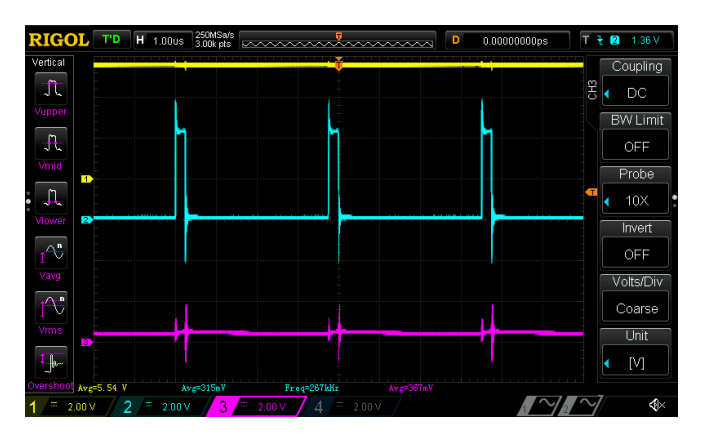
Figure 9. Device functionality then SPI code 64 at VDD 5.5V

Channel 1 (yellow/top line) – PIN#1 (VDD) Channel 2 (light blue/2nd line) – PIN#4 (LED1_1) Channel 3 (magenta /bottom line) – PIN#10 (FB1)