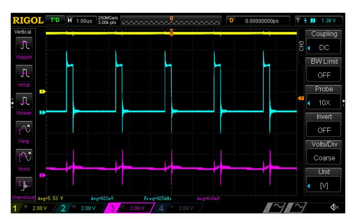
Figure 7. Device functionality then SPI code 128 at VDD 5.5V

Channel 1 (yellow/top line) – PIN#1 (VDD) Channel 2 (light blue/2nd line) – PIN#4 (LED1_1) Channel 3 (magenta /bottom line) – PIN#10 (FB1)