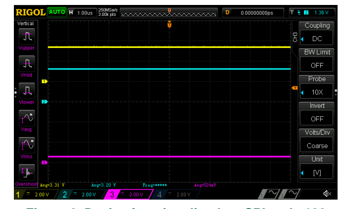
Figure 6. Device functionality then SPI code 192 at VDD 3.3V

Channel 1 (yellow/top line) – PIN#1 (VDD) Channel 2 (light blue/2nd line) – PIN#4 (LED1_1) Channel 3 (magenta /bottom line) – PIN#10 (FB1)