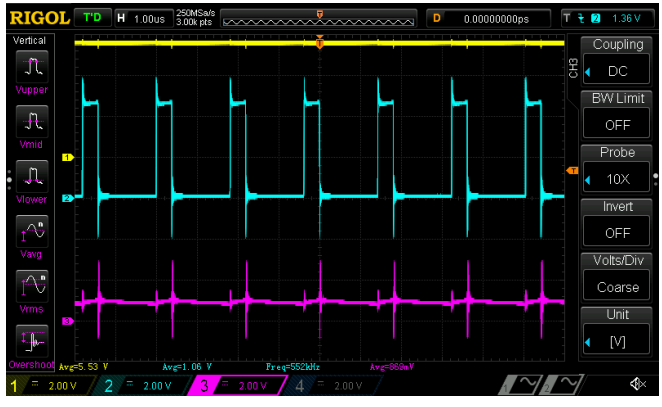
Figure 5. Device functionality then SPI code 192 at VDD 5.5V

Channel 1 (yellow/top line) – PIN#1 (VDD) Channel 2 (light blue/2nd line) – PIN#4 (LED1_1) Channel 3 (magenta /bottom line) – PIN#10 (FB1)