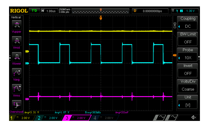
Figure 10. Device functionality then SPI code 64 at VDD 3.3V

Channel 1 (yellow/top line) – PIN#1 (VDD) Channel 2 (light blue/2nd line) – PIN#4 (LED1_1) Channel 3 (magenta /bottom line) – PIN#10 (FB1)