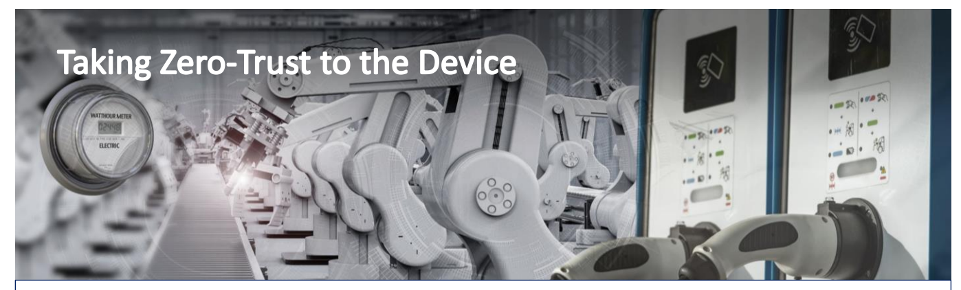
Protecting the Operational Integrity of Devices Against Tomorrow's Threats

NanoLock Security protects the operational integrity of connected devices and machines, in critical and industrial infrastructure, against cyber events and human errors. NanoLock is the only zero-trust device-level solution that prevents outsiders, insiders and supply chain cyber events as well as human errors without affecting the device/machine functionality and performance. NanoLock protects smart meters, EV chargers, data concentrators, industrial controllers, IIOT(Industrial IoT) and the like.