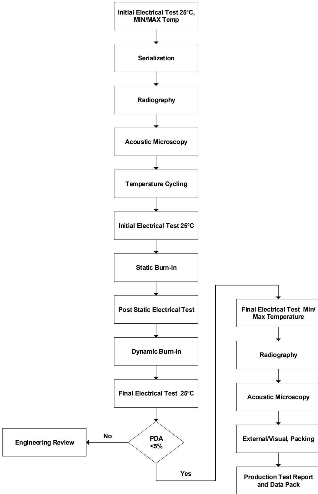
Figure 1. Flow Chart

This section outlines the production flow that 100% of the radiation hardened plastic products receive. This testing flow aligns with industry accepted standards including SAE AS6294/1 and NASA PEMS-INST-001.