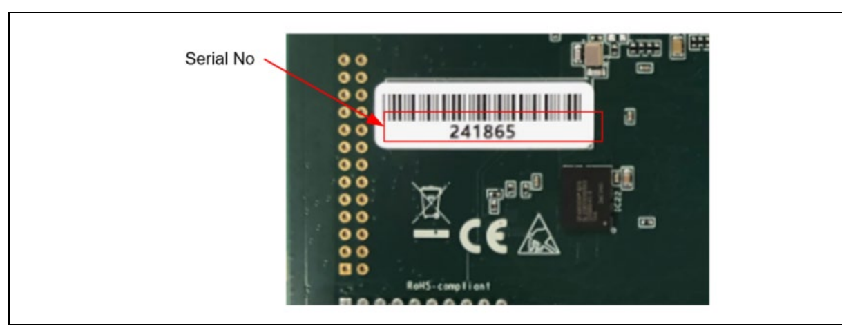
Figure 1: Serial No. location (CPU board solder side)

Part number: RTK9RZN2L0S00000BE Serial number: 241783 to 241882