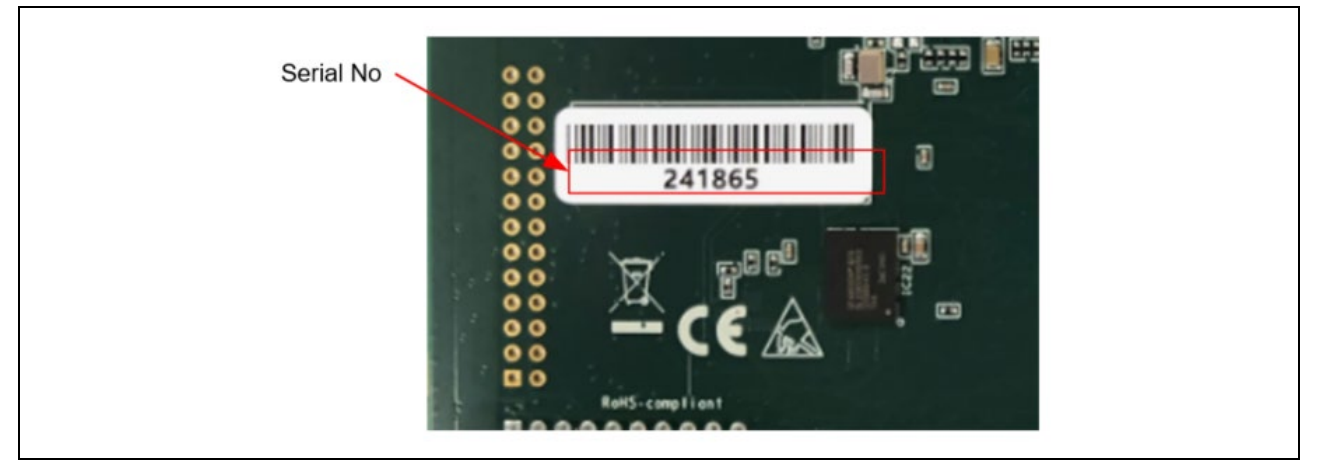
Figure 1: Serial No. location (CPU board solder side)

xxxxx : Indicate completion. Note the Request Period.