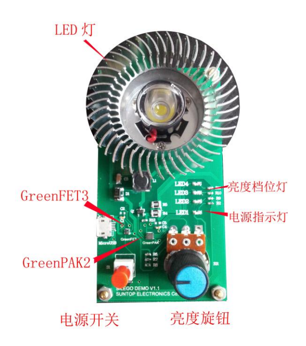
Figure 1. Dimming LED Driver

The demo board is connected to 5V power supply via microUSB interface. This is self-locked power switch which can control on and off using GreenFET3 chip. When the device turns on power, the indicator light becomes red, and the signal goes to GreenPAK chip. Rotating the brightness knob (clockwise to increase) can control LED's brightness. Those 3 LEDs (green) indicate the current brightness values. Notes: As LED light is intensive, please do not look directly in order to avoid hurting your eyes.