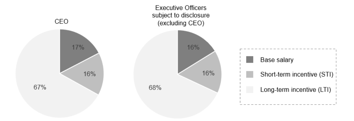
(Note) Each compensation element is based on a target base amount before reflecting performance (as of December 31, 2022)

The percentage of the variable portion is greater than the current general situation of executive compensation in Japan because it rewards Executive Officers for company performance and individual performance.