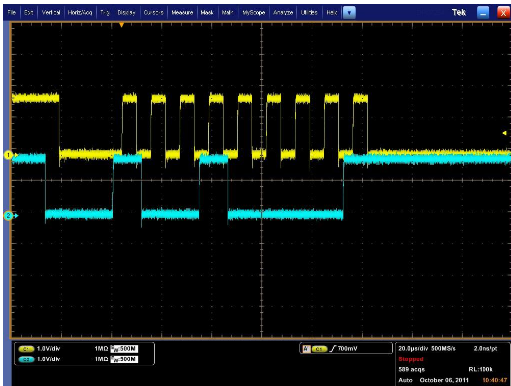
Figure 1: Diagram Example

The workaround suggested will prevent a NAK on the first communication. It is assumed that the software will correctly deal with any other status messages from the I2C communication.