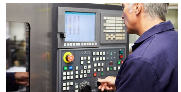
Computer numerical control (CNC)