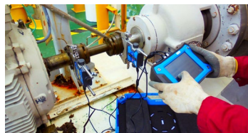
Pump and bearing