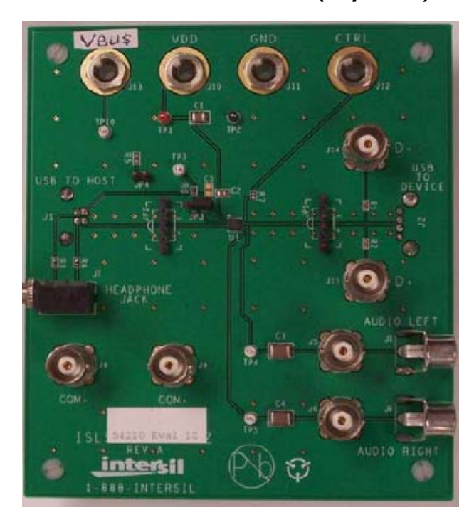
FIGURE 1. ISL54210EVAL1Z EVALUATION BOARD