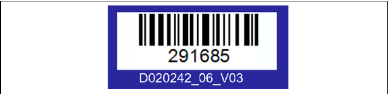
Figure 1. Identification of the Serial Number on the EK-RA4L1 Board